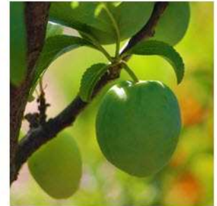
Plums & Pluots