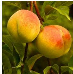
Peaches & Nectarines